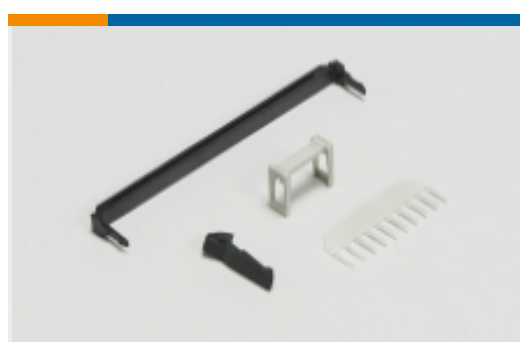
Ribbon Connector Accessories(13)