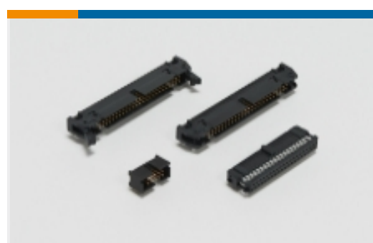
Ribbon Cable Connectors(525)